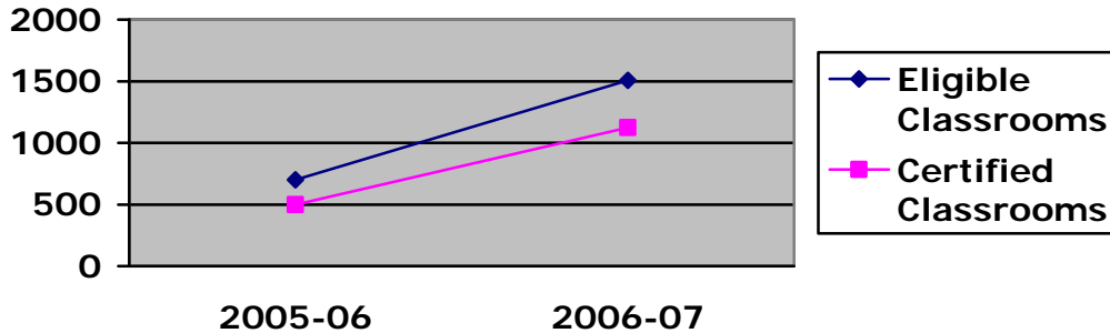
Figure 2. Increase in Eligible Classrooms for School Readiness Certification and Awarded Texas School Ready! Certification from 2005-2006 to 2006-2007

The graph below shows the increase in the number of preschool classrooms that were eligible to be considered for certification (i.e., all necessary information was submitted) from the first year of the Texas School Ready! program (2005-06) to the second year of the program (2006-07); as well as the increase from the first to the second year in the number of classrooms earning Texas School Ready! certification.